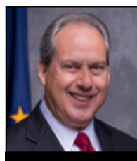
PHIL BOOTS State Senator

This is a great opportunity for young people in our state to get a closer look at how government works in real time, and I look