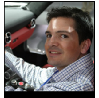
CASEY WILLIAMS Auto Reviews

7-passengers, AWD Crossover Powertrain: 2.4-LT4, CVT Output: 260hp/277 lb.-ft. Suspension f/r: Ind/Ind Wheels f/r: 20"/20" Brakes f/r: disc/disc Towing: 5,000 lbs. Must-have features: Space, style Fuel economy: 20/26-MPG city/hwy Assembly: Lafayette, IN Base/as-tested price: $32,295/$41,320