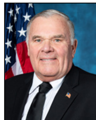
Rep. Jim Baird

Created in 1971, the Indiana Commission for Higher Education plans, coordinates and defines Indiana's postsecondary education system to align higher learning with the needs of students and the state. The Commission also administers Indiana's financial aid programs, including the 21st Century Scholars early college promise scholarship, which celebrated 30 years in 2020. Learn more about the Commission's Reaching Higher in a State of Change strategic plan at www.in.gov/che .