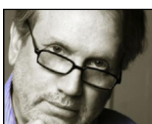
BRIAN HOWEY HOWEY POLITICS

Since the collapse of the Soviet Union in 1991, travel