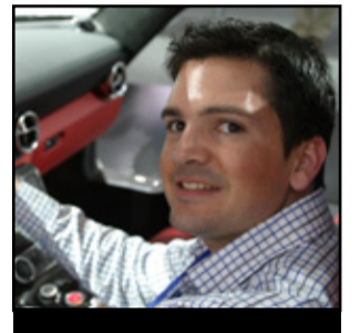
CASEY WILLIAMS Auto Reviews

7-passengers, 4WD SUV Powertrain: 3.6-L V6, 8-spd Output: 293 hp/260 lb.-ft. Suspension f/r: Air Ind/Ind Wheels f/r: 21"/21" alloy Brakes f/r: disc/disc Towing: 6,500 lbs Must-have features: Lux, Driving Fuel economy: 18/25-MPG city/hwy Assembly: Detroit, MI Base/as-tested price: $39,220/$67,090