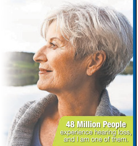
48 Million People experience hearing loss, and I am one of them.

But there's good news! High-quality hearing instruments — like the Belton Imagine™ — can ensure the auditory centers of your brain "stay busy", minimizing the effects of auditory deprivation.