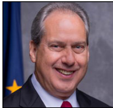
Sen. Phil Boots

House Enrolled Act 1002 phases down Indiana's income-tax rate to 2.9%, tied for the lowest rate in the nation, and could save Hoosier taxpayers up to $1 billion once fully implemented. This phased-in tax reduction is contingent on state revenue continuing to grow, ensuring we are still practicing the fiscal responsibility that got us here. Hoosiers will also benefit