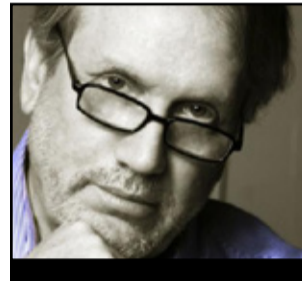
BRIAN HOWEY HOWEY POLITICS

Braun quickly attempted to walk that back, saying, "I misunderstood a line of questioning that ended up being about interracial marriage. Let me be clear on that issue – there is no question the Constitution prohibits discrimination of any kind based on race,