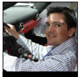
CASEY WILLIAMS Auto Reviews

Five-passenger, AWD Pickup Powertrain: 2.5-liter T4, 8-spd trans Output: 281hp/311 lb.-ft. torque Suspension f/r: Ind/Ind Wheels f/r: 20"/20" alloy Brakes f/r: disc/disc Must-have features: Style, Capability Towing: 5,000 lbs. Fuel economy: 19/27 mpg city/hwy Assembly: Montgomery, AL Base/As-tested price: $24,140/$41,100