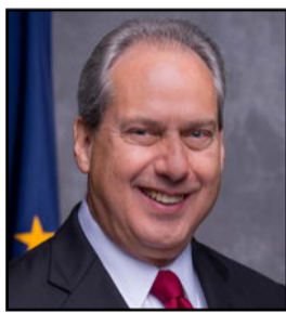
Sen. Phil Boots

Some of the topics my colleagues and I will be looking