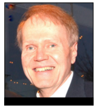
RIX QUINN Guest Column

Do you like to work with people? Perhaps you could be a tour guide,