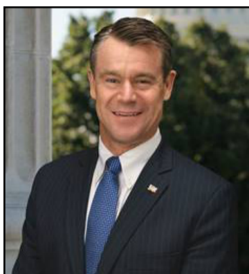
Senator Todd Young

Turnout in Montgomery County for this year's general election was 38.67%, or 9,921 total ballots cast. The County Clerk's office was unavailable for comment.