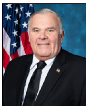
Rep. Jim Baird (IN-4)

Board (At-large): *Top 3 vote earners win