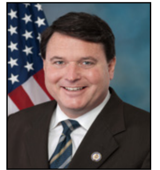
Attorney General Todd Rokita

In affirming a district court's injunction, the appeals court observed that President Biden's use of the federal Procurement Act to claim executive power to