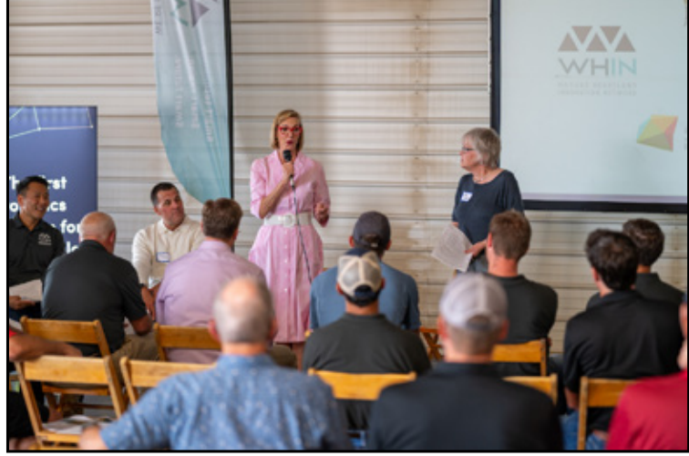
Lt. Governor Suzanne Crouch speaking at the Roundtable host-