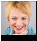
CARRIE CLASSON The Postscript