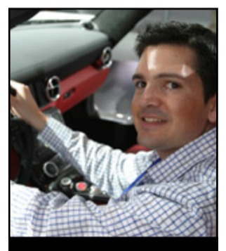
CASEY WILLIAMS Auto Reviews

My parents do like their Equinox. It offers nearly mid-size space with compact fuel economy and the practicality to make it fit their daily lives – whether heading to dinner, driving to the Smokey Mountains, or carrying their grand-kids’ gear. Base models start at $26,600 with our