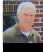
BUTCH DALE COLUMNIST

There are very few western movies in theaters nowadays, and like many of today's flicks, they are full of extreme violence, gore, cursing, and sex. Where are the good guys in the white hats? We need Leonard Slye back on the screen. You remember him, don't you? Well, you likely know Leonard by his acting name...Roy Rogers, the singing and yodeling "King of the Cowboys."