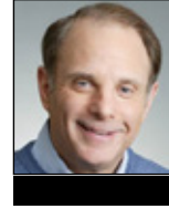
DICK WOLFSIE Funny Bone

Christmas morning 2023 will be a big disappointment for me.