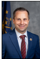
Sen. Spencer Deery