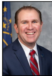
Sen. Brian Buchanan