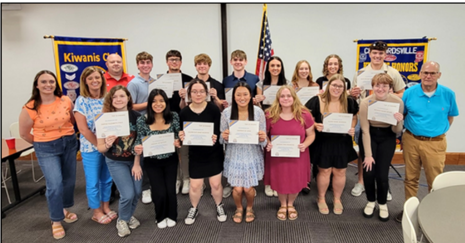
Southmont High School