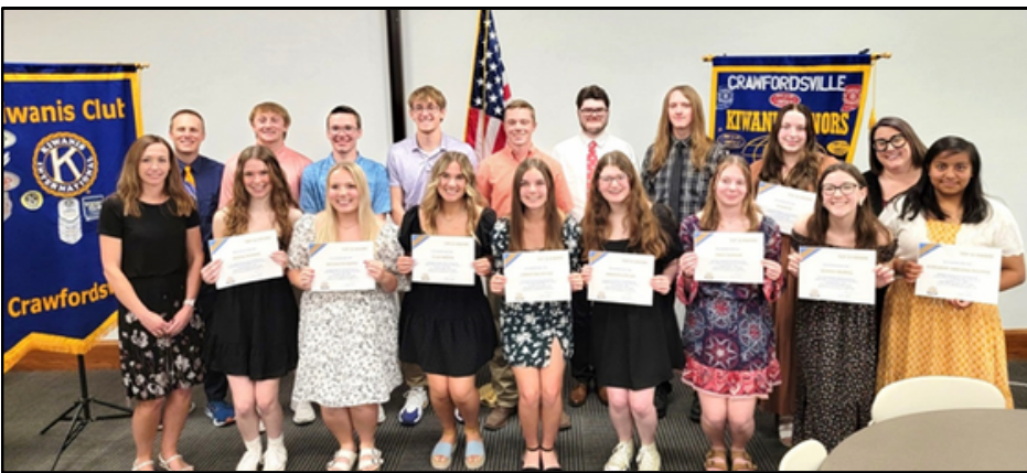
North Montgomery High School