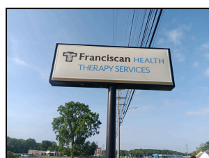
The sign for the new Franciscan Health Therapy Services Crawfordsville building.

our neighbors in Crawfordsville and the surrounding communities."