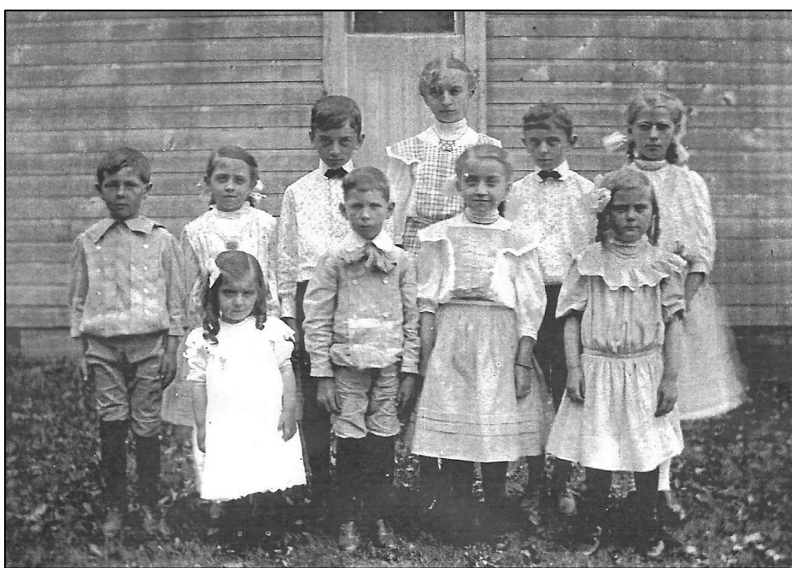
These Potato Creek school students are dressed in their finest for the class photo in the early 1900s. Each township in Montgomery county had several of these one-room schools back in the day.

Sixberry encourages those who don’t run for office to engage more with each other and become more active with their political party on a local level. In the meantime, she makes herself available.