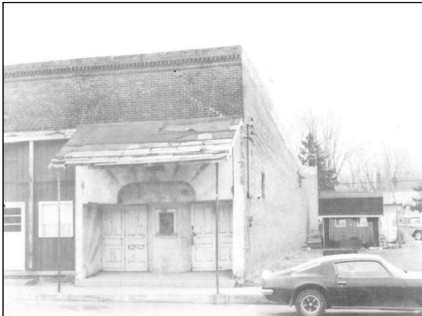
Many small towns had their own theater, and a few showed movies on the side of downtown buildings. This is a photo of the Sunshine theater in Darlington before it was demolished in the 1980s. I went to the theater many times as a child before it closed in 1959. Tickets were 25 cents and popcorn was 10 cents. Now all that is left are the memories ....