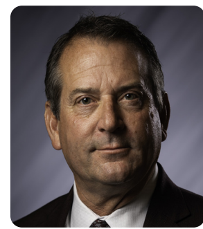
Mark Genda House Representative

Please note the program does not cover all home energy expenses, so it is important that you continue to pay your utility bills. Hoosiers at risk of having their utilities disconnected should contact their provider as soon as possible to discuss payments. You can find a map of utility providers here, or simply call 211 for local resources.