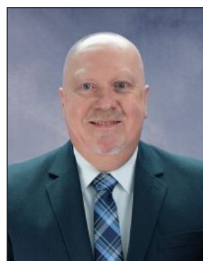
Mayor Todd Barton

public to come ask questions, discuss concerns, interact with the mayor and learn more about anything regarding the city.