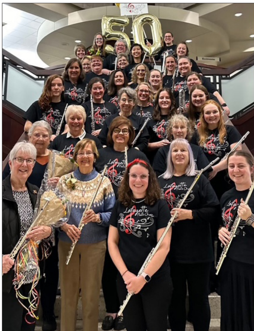
The Lafayette Flute Chir will perform in concert Sunday at 4 p.m. at Wabash Avenue Presbyterian.

Wabash Avenue Presbyterian Church is located at 307 S. Washington.