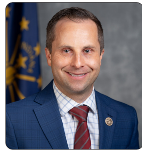
Spencer Deery State Senator