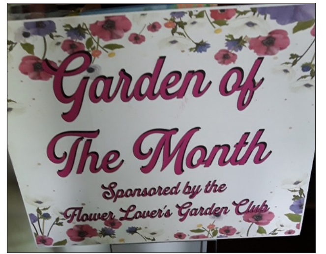
This sign will identify the homes that are part of the program.