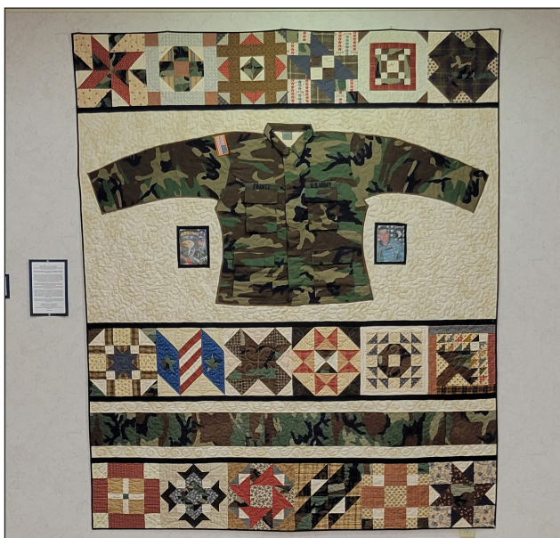
This exhibit has many deeply personal stories but it also includes a wide variety of lighthearted interpretations and dedications to great monuments.

Some of the items are quilted by hand, some by machine, and others on a long-arm sewing machine. They use a wide variety of fabrics including vintage cloth, reproduction fabric, and modern blends.