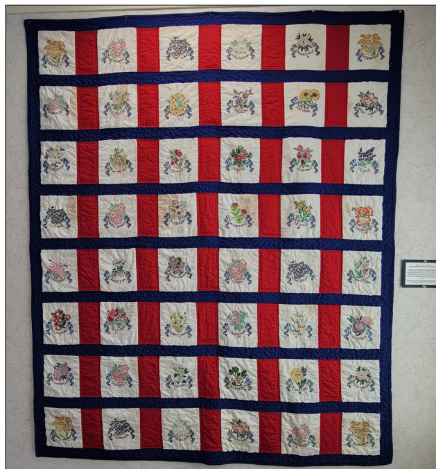
The quilts in this exhibit tell visitors about our personal histories and long-loved traditions.