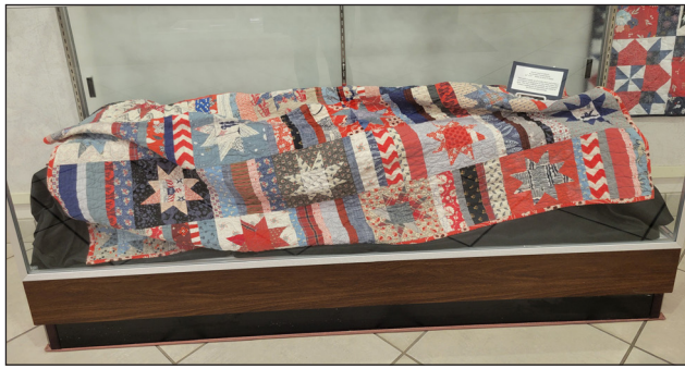
Over two dozen patriotic textiles will be on display now

The Guild has shared its work with the community since the group was created and has exhibited its textiles at CDPL almost every year since 1995. Their themes have expanded far beyond early quilting concepts to include an array of imagery and text. The techniques used include machine-sewn, hand-sewn, and machine embroidered.